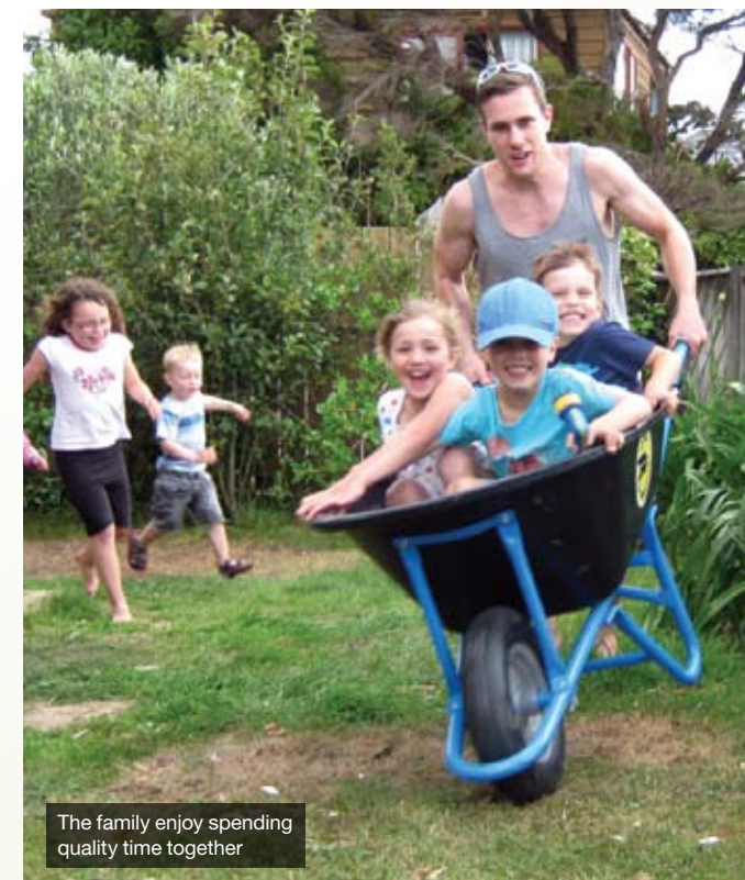
The family enjoy spending quality time together

When you're here, embrace the Kiwi way! 🇳🇿